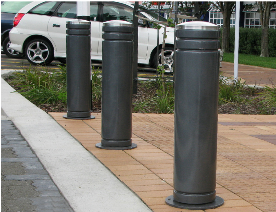
Resilient Bollards, Naenae Shopping Centre, Lower Hutt