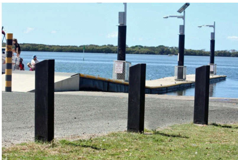
Decorative Brolga Bollards