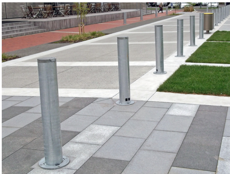
Retractable Bollard, Lower Hutt Civic Centre

The robust and sturdy Retractable Bollard is normally supplied with a hot dip galvanised finish. It can be powder coated to colour of choice if required.